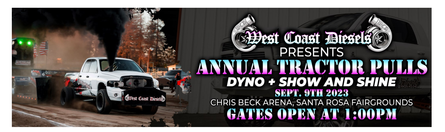
Click HERE for more information on the Tractor Pulls!