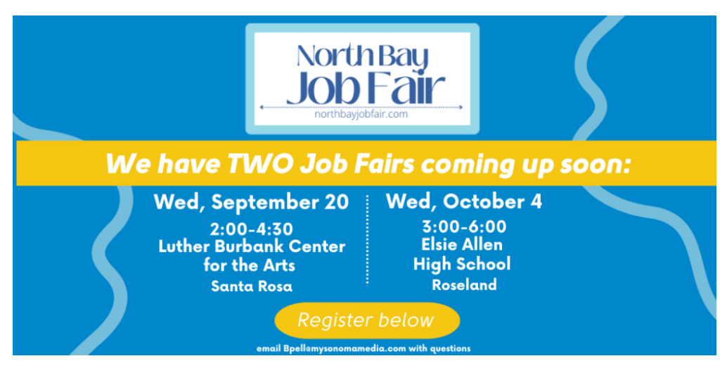
North Bay Job Fair | Amaturo Sonoma Media Group

However, trucking firms are bound by the PLA policy. As an example, it is fine for Canyon Rock to bid on aggregate, sand, gravel, and even ready-mix concrete-but the products have to be delivered to the project site by truckers that are under the PLA policy-in other words-truckers have to be Teamsters. It was noted that there are no signatory trucking firms in Northern California that have the resources to handle our local trucking needs, and the City of Santa Rosa PLA policy also requires trucking firms to meet the 30% local hire part of the PLA policy. In practice, both the ECA and the City of Santa Rosa believe that there will be no signatory trucking firms that can meet the 30% local hire requirement, so how that will be handled is the big question mark that we are faced with at this time. There are several projects coming out to bid in the next 30 days, so the PLA will get a "test" quickly. Continue page 4