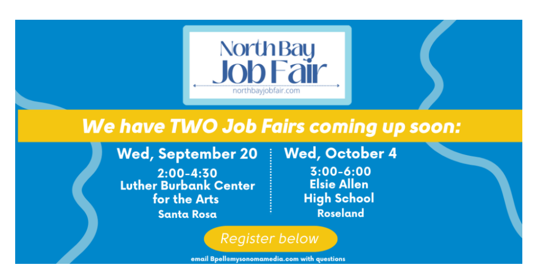
North Bay Job Fair | Amaturo Sonoma Media Group

Roadwork in Sonoma County - Check out the County website for road info here