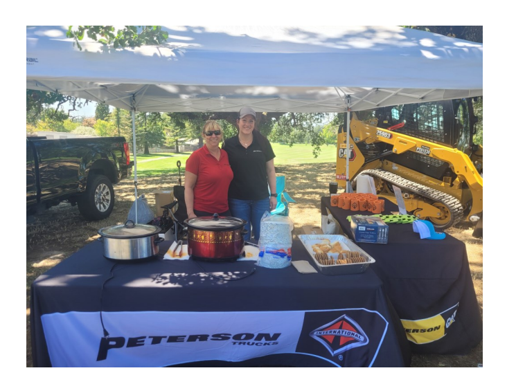
Peterson Trucks—Hospitality Hole Sponsor