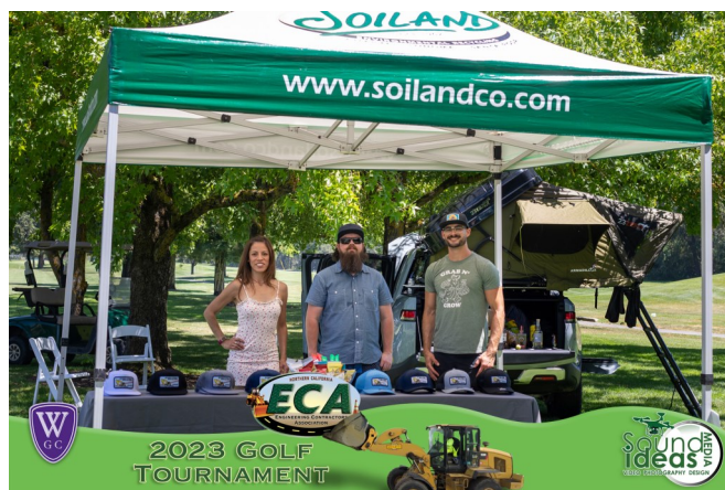
Soiland Company—Hospitality Hole Sponsor