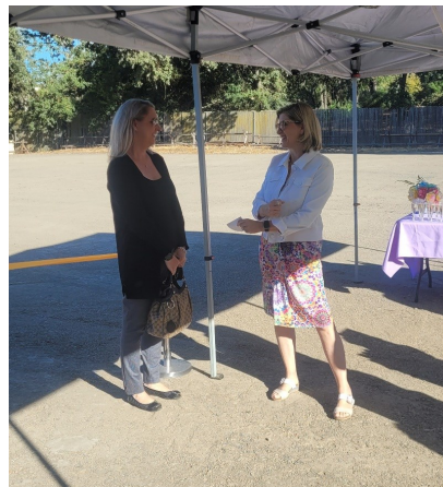
Photos of the Ribbon Cutting at the Children's Museum