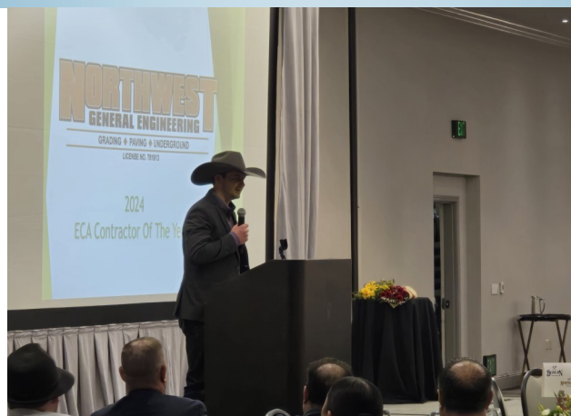
2024 Contractor of the Year Northwest General Engineering